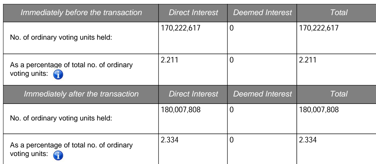
Table 1. Change in respect of ordinary voting units of Listed Issuer